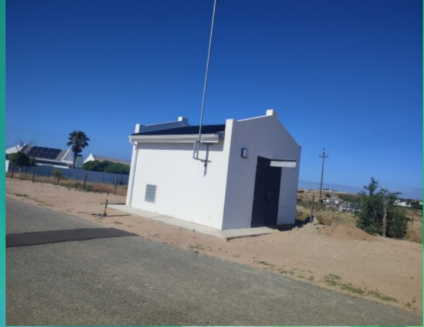
The new pump station under construction corner of Loop and Kenilworth Roads